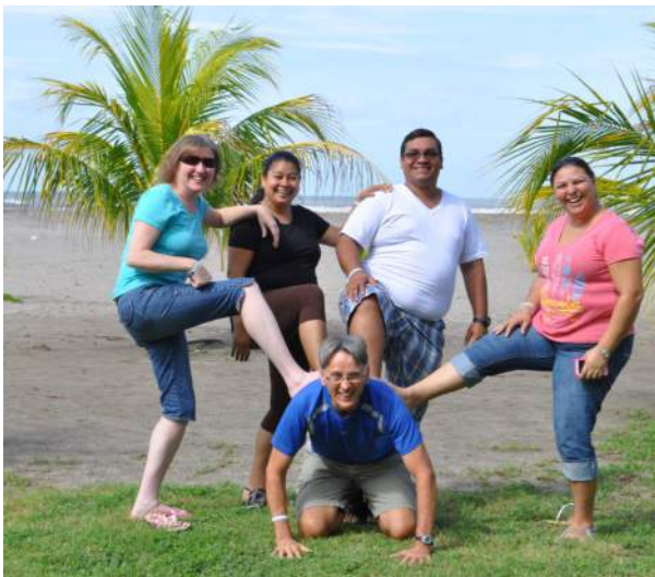
Leadership Team Hard at Work and Play!

It was difficult for the team to contain their enthusiasm at the first staff meeting under new direction, held in October in Nicaragua. Planning for 2016 and beyond is underway!