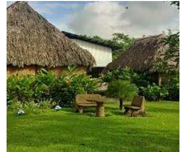
Skylark, October 2015