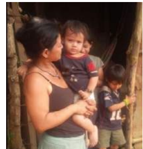
A young family from the Los Medranos community

Capital projects: Completion of perimeter wall for security and future growth