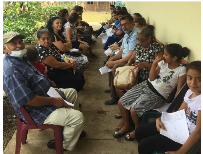
Local residents waiting patiently at the April medical clinic